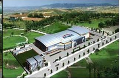
TORRENT PHARMA, Baddi ( HP )

We are known for Project Management Consultancy (PMC) and Project Execution & Monitoring