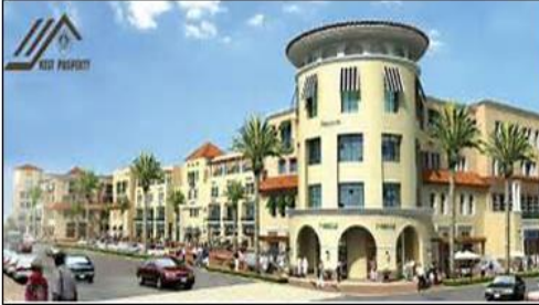
CENTRAL PLAZA (EmaarMGF), Mohali