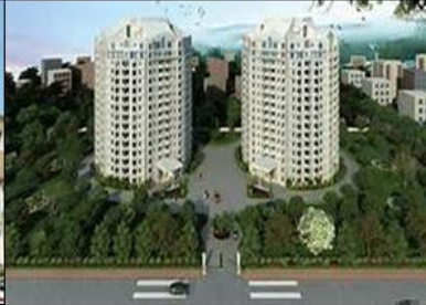
MALIBU TOWN, Gurgaon